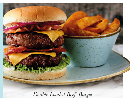
Double Loaded Beef Burger

Southern fried chicken burger with two slices of cheese, two rashers of back bacon, lettuce, red onion, sliced tomato and our signature mayonnaise